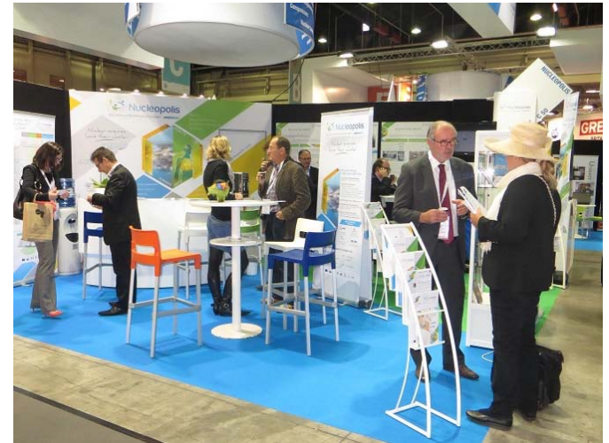
2016 WNE edition – Nucleopolis/GANIL booth